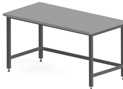
H Metal base "H" shaped