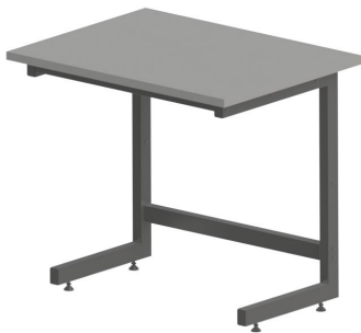
C Metal base "C" shaped