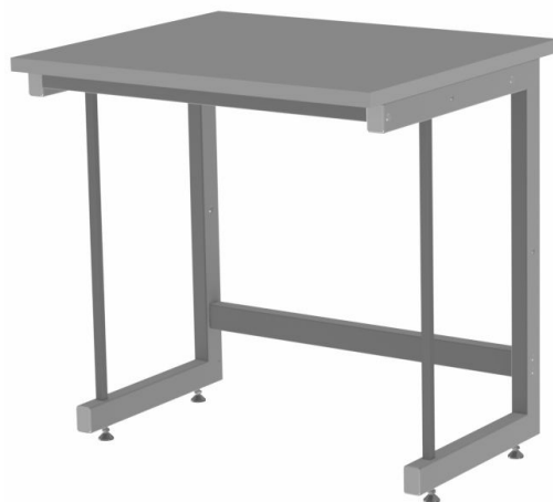
"C" shape complemented by a reinforcement "CH"